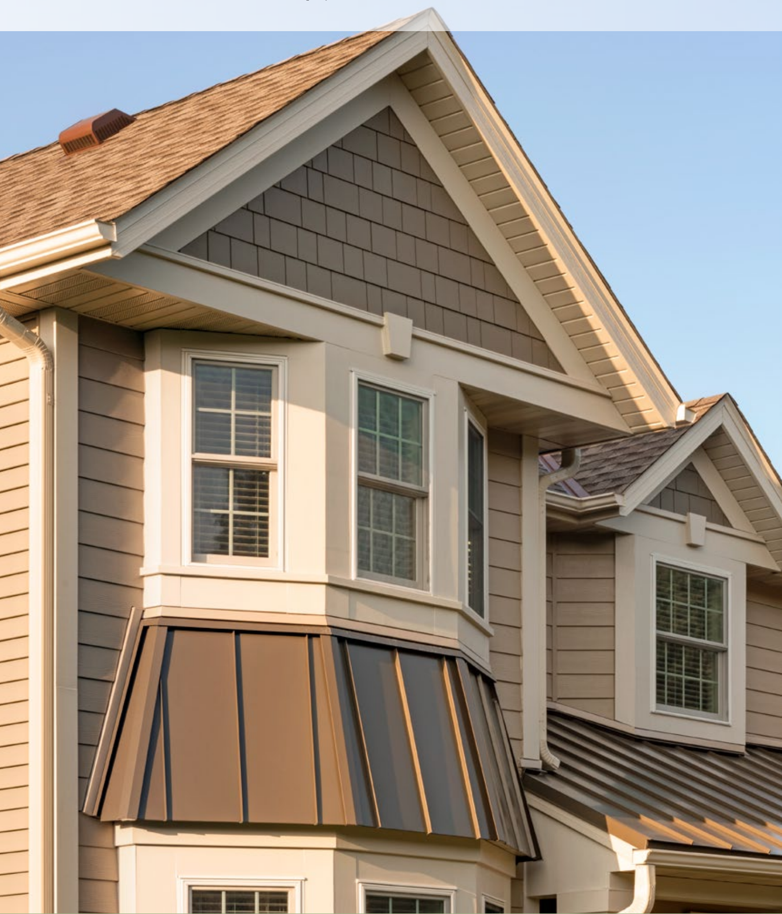
The Better Way to a Better Window °