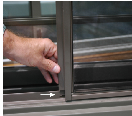
Push insect screen with astragal to the far right

NOTE: Warning label should face the interior of the home and be located at the bottom.